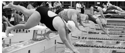
A good clean start