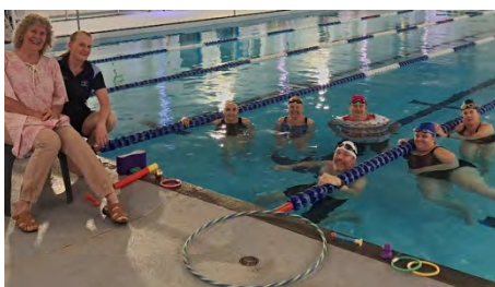
Coaches’ Christmas 2025 fun at the Hills